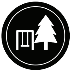
New 5+ acre park