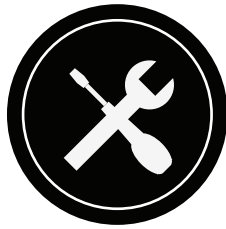
All builders are welcome