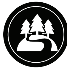
High and Dry: Outside of 500-year flood plain